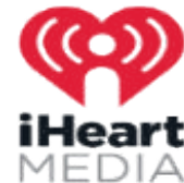
iHeart Media – Media Sponsorship