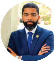
Chokwe A. Lumumba, Mayor City of Jackson